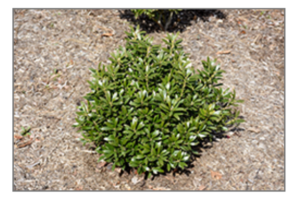
Gem Box Inkberry Holly