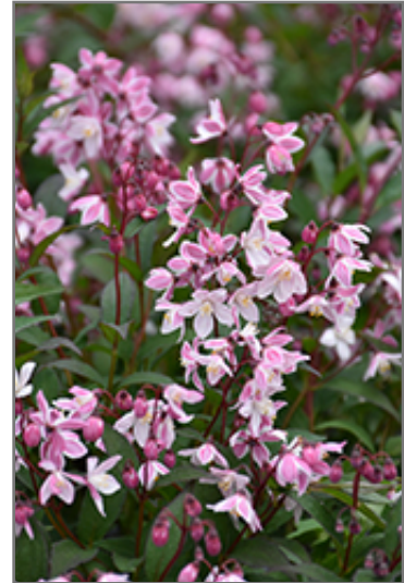
Yuki Cherry Blossom Deutzia flowers