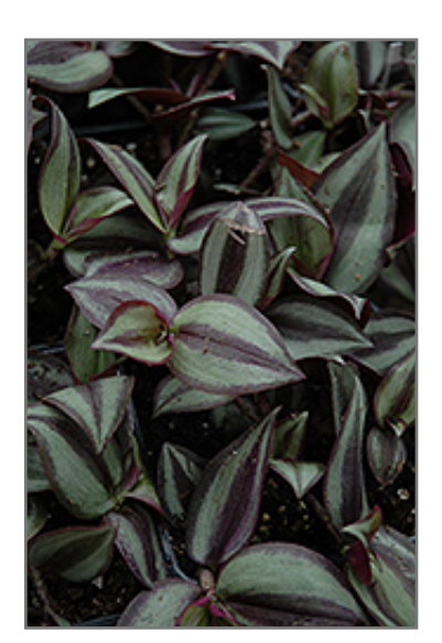
Wandering Jew foliage

When grown indoors, Wandering Jew can be expected to grow to be about 14 inches tall at maturity, with a spread of 14 inches. It grows at a fast rate, and under ideal conditions can be expected to live for approximately 10 years. This houseplant performs well in both bright or indirect sunlight and strong artificial light, and can therefore be situated in almost any well-lit room or location. It prefers to grow in average to moist soil. The surface of the soil shouldn't be allowed to dry out completely, and so you should expect to water this plant once and possibly even twice each week. Be aware that your particular watering schedule may vary depending on its location in the room, the pot size, plant size and other conditions; if in doubt, ask one of our experts in the store for advice. It is not particular as to soil type or pH; an average potting soil should work just fine.