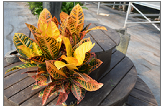
Variegated Croton