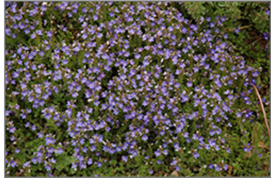
Turkish Speedwell in bloom

Turkish Speedwell is recommended for the following landscape applications;