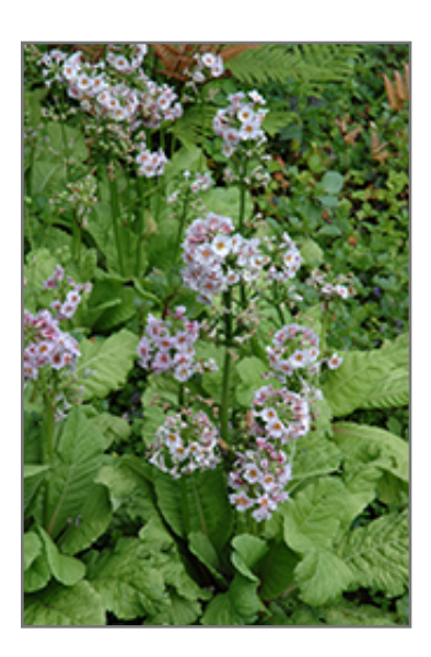
Candelabra Primrose in bloom

This variety features tiered clusters of blooms in shades of lavender and pink with red-yellow in the centers, all above a mound of light green foliage; a colorful display in a border or container planting