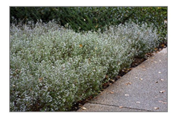
Dwarf Calamint in bloom

Dwarf Calamint is recommended for the following landscape applications;