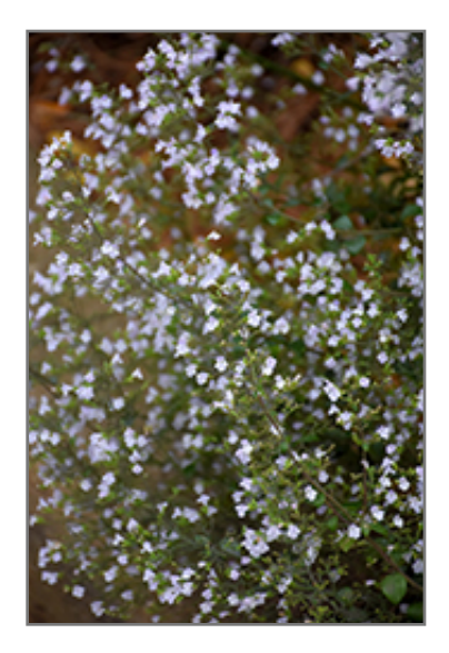
Dwarf Calamint flowers