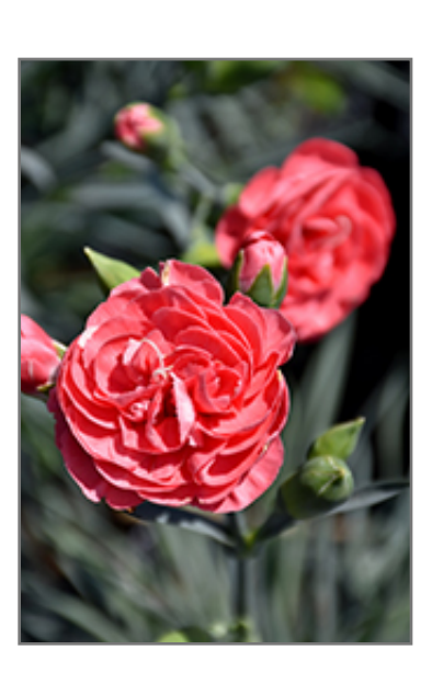
Devon Cottage Rosie Cheeks Pinks flowers