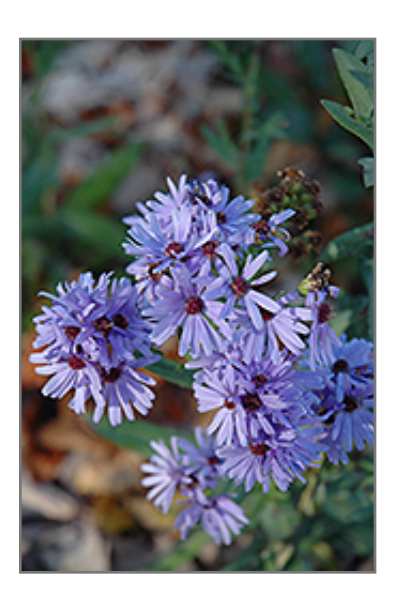
Smooth Aster flowers