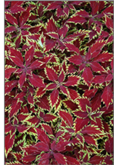
ColorBlaze Royale Apple Brandy Coleus foliage