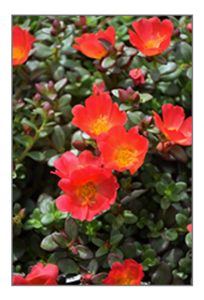
Mojave Red Portulaca flowers