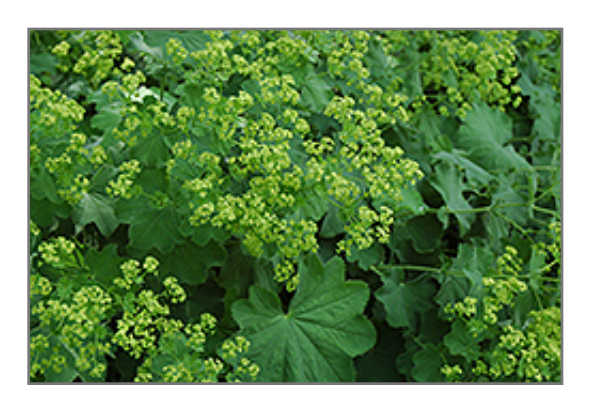
Lady's Mantle flowers

Lady's Mantle is recommended for the following landscape applications;