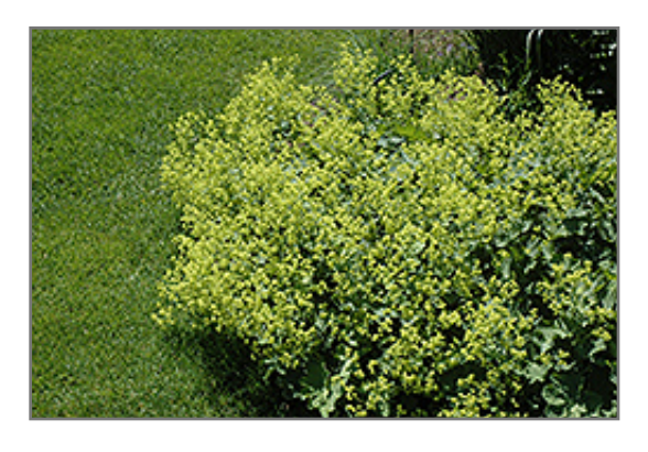
Lady's Mantle in bloom