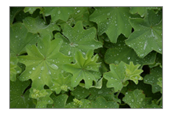
Lady's Mantle foliage

Lady's Mantle will grow to be about 18 inches tall at maturity, with a spread of 18 inches. Its foliage tends to remain dense right to the ground, not requiring facer plants in front. It grows at a medium rate, and under ideal conditions can be expected to live for approximately 10 years. As an herbaceous perennial, this plant will usually die back to the crown each winter, and will regrow from the base each spring. Be careful not to disturb the crown in late winter when it may not be readily seen!