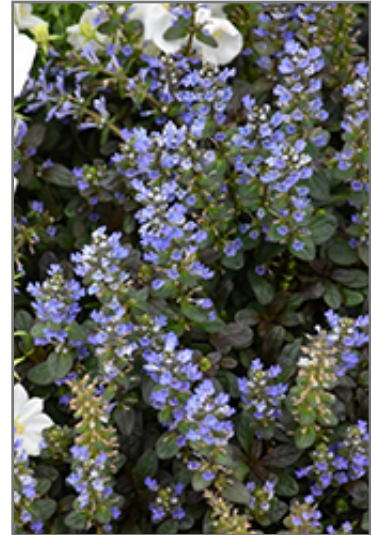
Chocolate Chip Bugleweed flowers

Chocolate Chip Bugleweed is recommended for the following landscape applications;