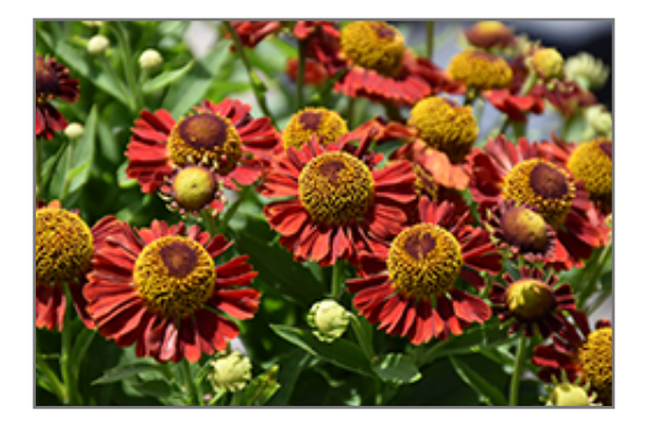
Mariachi Salsa Sneezeweed flowers