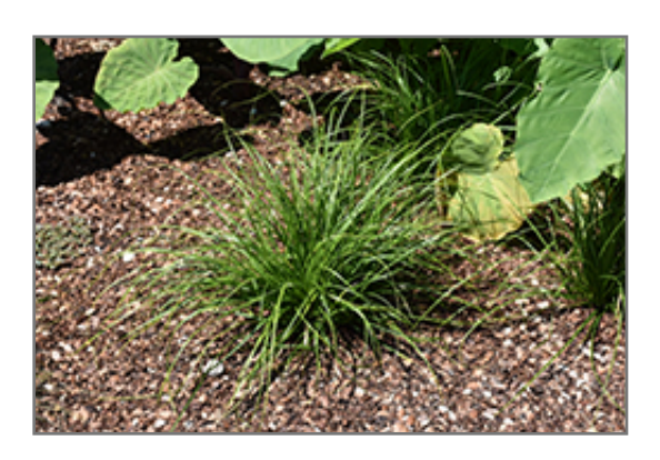
Cherokee Sedge

Slow spreading clumps of fine, narrow grasslike green leaves; a great look when massed along a moist border; perfect for low, wet spots or pondside, do not let it dry out