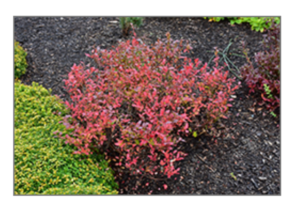
Lowbush Blueberry in fall

This is an open spreading deciduous shrub with a spreading, ground-hugging habit of growth. Its relatively fine texture sets it apart from other landscape plants with less refined foliage. This is a relatively low maintenance plant, and usually looks its best without pruning, although it will tolerate pruning. It is a good choice for attracting birds to your yard. It has no significant negative characteristics.