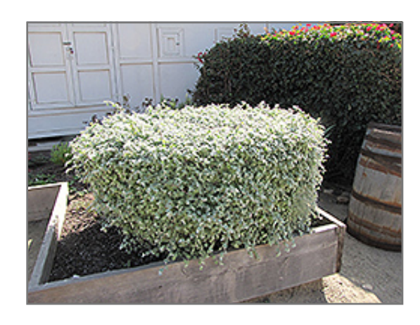
Licorice Plant