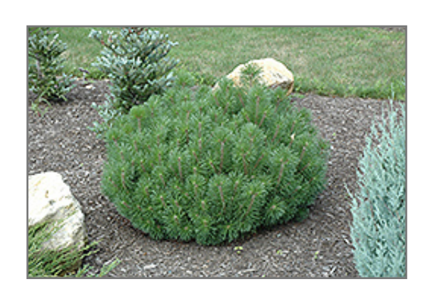
Enci Mugo Pine

An upright and spreading evergreen shrub which eventually becomes wider than high, rich green needles, forms a dense mound of upright branches, far more compact than the species; great in mass or used as a tall groundcover, very adaptable and tough