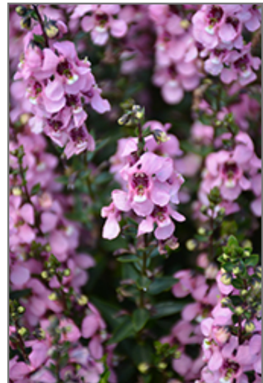
Serenita Pink Angelonia flowers