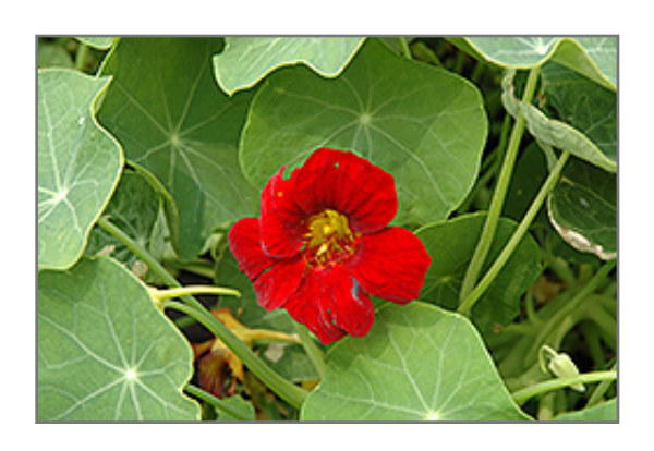
Crimson Emperor Nasturtium flowers