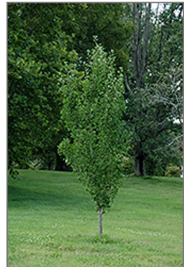
Presidential Gold Ginkgo