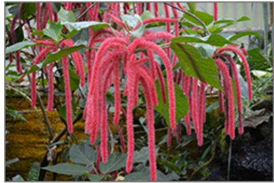
Firetail Chenille Plant flowers