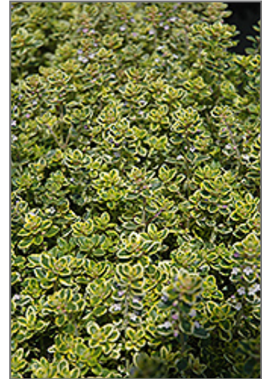
Lemon Thyme foliage

Lemon Thyme is smothered in stunning spikes of lilac purple flowers rising above the foliage from early to late summer. Its attractive tiny fragrant round leaves remain light green in color throughout the year.