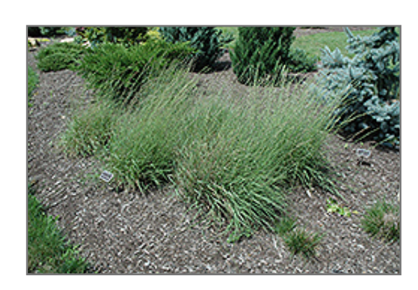
Sideoats Grama

This native variety is noted for its distinctive arrangement of oat-like that hang from only one side of the flowering stem; purplish inflorescences mature to tan as the seeds mature; blue-green foliage turns reddish-purple in fall; use as a border accent