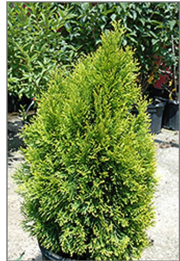
Highlights Arborvitae