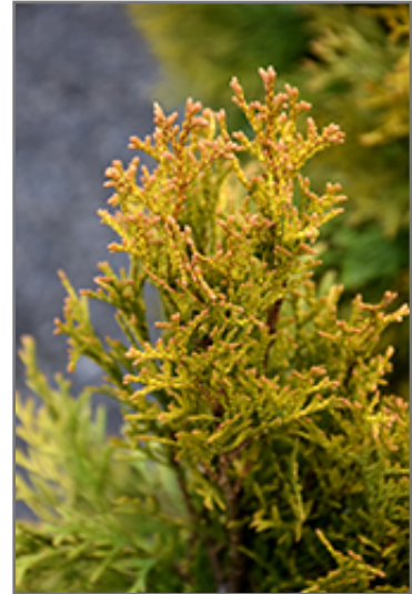
Highlights Arborvitae foliage

This tree does best in full sun to partial shade. It prefers to grow in average to moist conditions, and shouldn't be allowed to dry out. It is not particular as to soil type or pH. It is somewhat tolerant of urban pollution, and will benefit from being planted in a relatively sheltered location. Consider applying a thick mulch around the root zone in winter to protect it in exposed locations or colder microclimates. This is a selection of a native North American species.