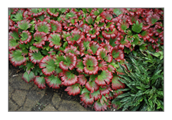
Karasuba Mukdenia

Karasuba Mukdenia features dainty spikes of white bell-shaped flowers rising above the foliage from early to mid spring. Its attractive glossy fan-shaped leaves emerge coppery-bronze in spring, turning dark green in color with prominent crimson tips throughout the season.