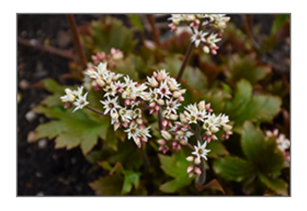
Karasuba Mukdenia flowers