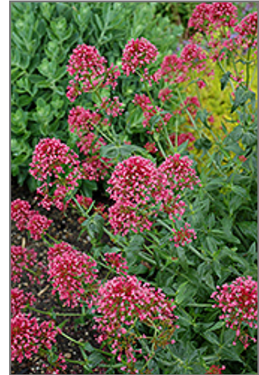
Red Valerian flowers

Red Valerian is recommended for the following landscape applications;