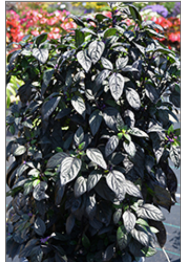
Black Pearl Ornamental Pepper