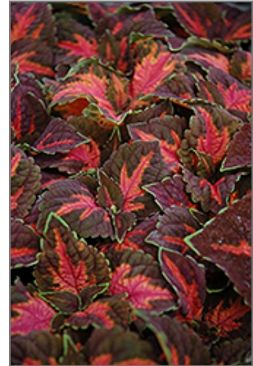
Superfine Rainbow Festive Dance Coleus foliage