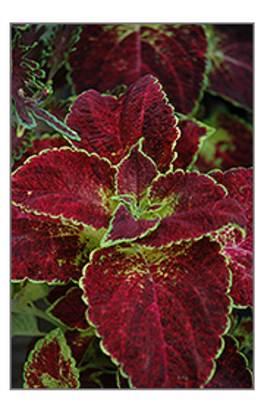
ColorBlaze Dipt in Wine Coleus foliage