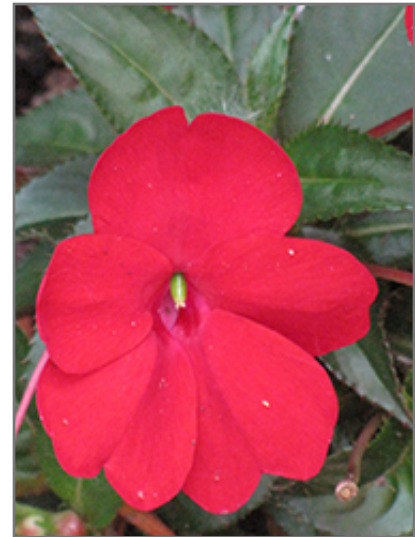
SunPatiens Compact Red New Guinea Impatiens flowers

This plant will require occasional maintenance and upkeep, and should not require much pruning, except when necessary, such as to remove dieback. It is a good choice for attracting bees and butterflies to your yard. It has no significant negative characteristics.