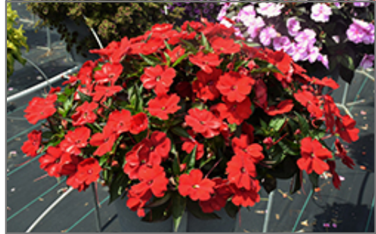
SunPatiens Compact Red New Guinea Impatiens in bloom

SunPatiens Compact Red New Guinea Impatiens is a fine choice for the garden, but it is also a good selection for planting in outdoor containers and hanging baskets. It can be used either as 'filler' or as a 'thriller' in the 'spiller-thriller-filler' container combination, depending on the height and form of the other plants used in the container planting. It is even sizeable enough that it can be grown alone in a suitable container. Note that when growing plants in outdoor containers and baskets, they may require more frequent waterings than they would in the yard or garden.