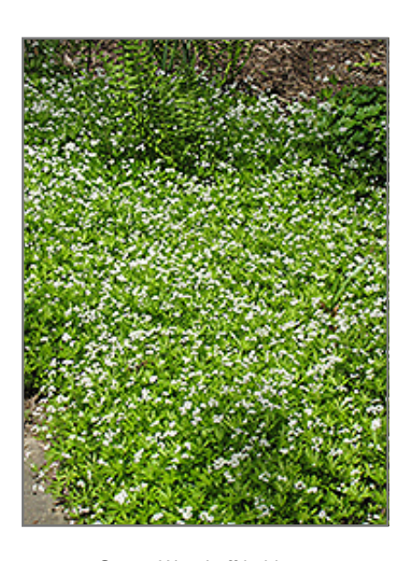
Sweet Woodruff in bloom