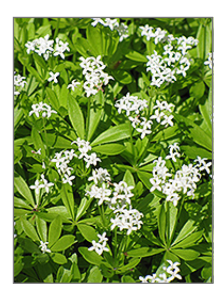
Sweet Woodruff flowers