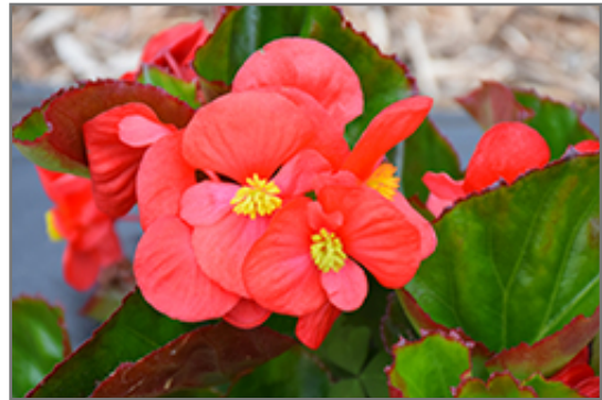
Big Red Green Leaf Begonia flowers