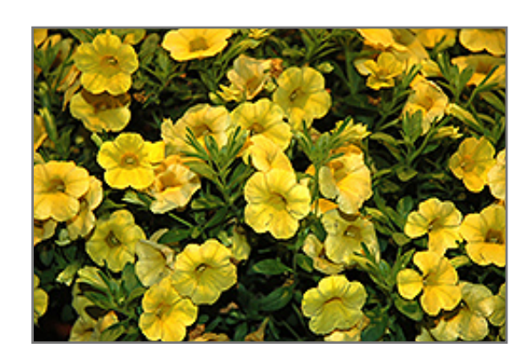
Callie Yellow Calibrachoa flowers