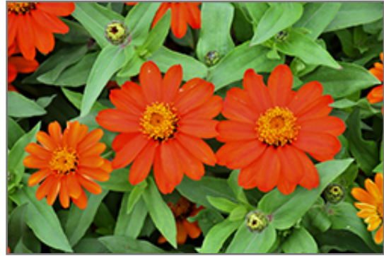
Zahara Fire Zinnia flowers

Zahara Fire Zinnia is recommended for the following landscape applications;