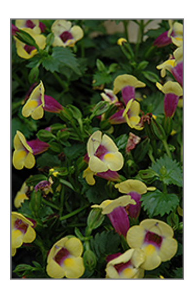
Yellow Moon Torenia flowers

Yellow Moon Torenia is an herbaceous annual with a trailing habit of growth, eventually spilling over the edges of hanging baskets and containers. Its relatively fine texture sets it apart from other garden plants with less refined foliage.