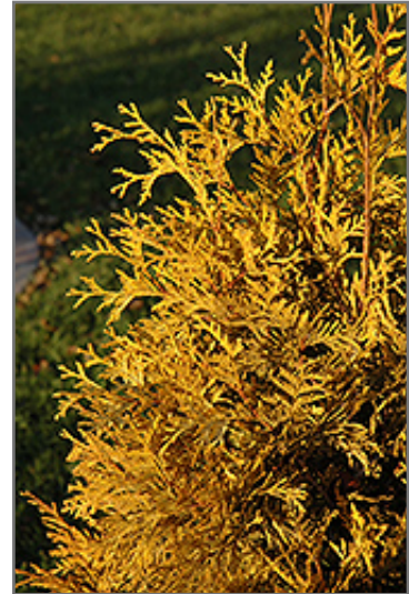
Yellow Ribbon Arborvitae in fall

* This is a 'special order' plant - contact store for details