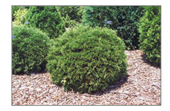
Hetz Midget Arborvitae

Hetz Midget Arborvitae will grow to be about 24 inches tall at maturity, with a spread of 3 feet. It tends to fill out right to the ground and therefore doesn't necessarily require facer plants in front. It grows at a slow rate, and under ideal conditions can be expected to live for approximately 30 years.