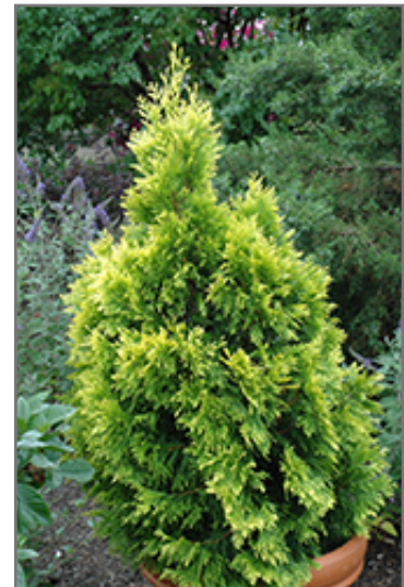
4ever Goldy Arborvitae