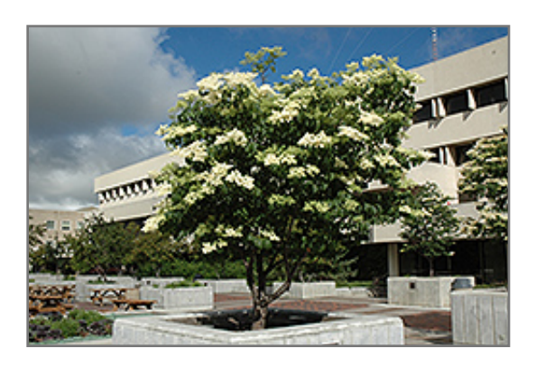
Ivory Silk Japanese Tree Lilac in bloom