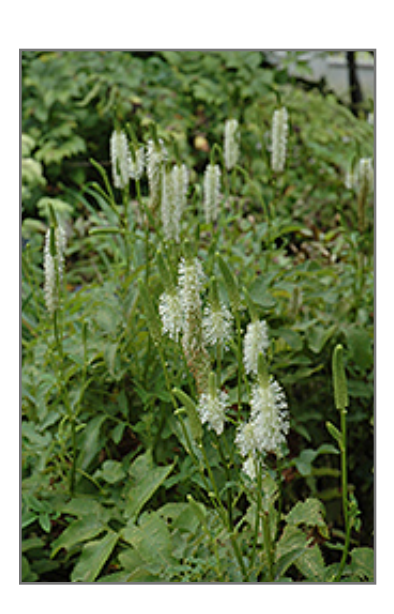
Canadian Burnet flowers

A clump forming wetland plant producing white bottlebrush-like flowers thru summer that are ideal for cutting, held atop attractive compound leaves; a pretty addition to the garden, or near water features