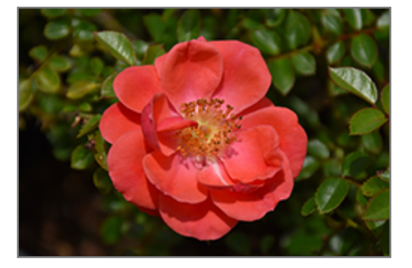
Oso Easy Mango Salsa Rose flowers

This shrub will require occasional maintenance and upkeep, and is best pruned in late winter once the threat of extreme cold has passed. Gardeners should be aware of the following characteristic(s) that may warrant special consideration;