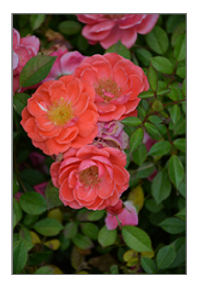
Oso Easy Mango Salsa Rose flowers