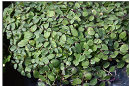
County Park Star Creeper foliage