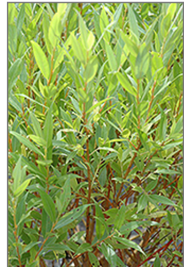
Flame Willow foliage