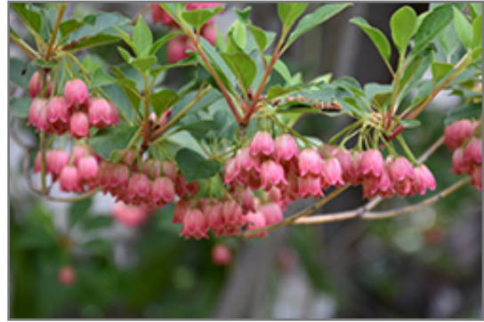
Redvein Enkianthus flowers