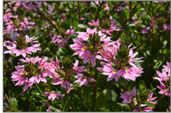
Bombay Pink Fan Flower flowers

Bombay Pink Fan Flower is recommended for the following landscape applications;