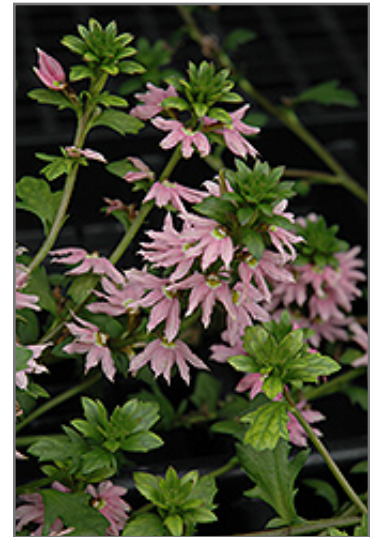
Bombay Pink Fan Flower flowers