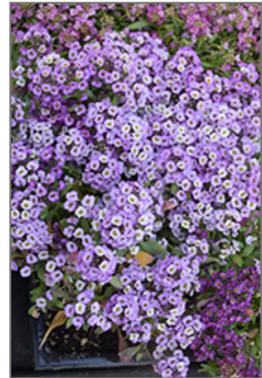
Clear Crystal Lavender Shades Sweet Alyssum flowers

Clear Crystal Lavender Shades Sweet Alyssum is recommended for the following landscape applications;