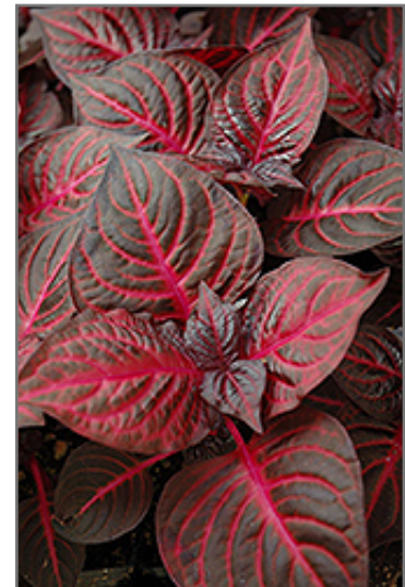
Blazin' Rose Blood Leaf foliage