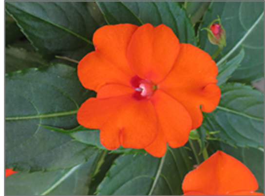
Infinity Orange New Guinea Impatiens flowers

Infinity Orange New Guinea Impatiens is recommended for the following landscape applications;