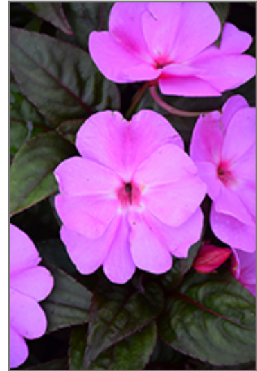
Divine Lavender New Guinea Impatiens flowers

Divine Lavender New Guinea Impatiens is recommended for the following landscape applications;